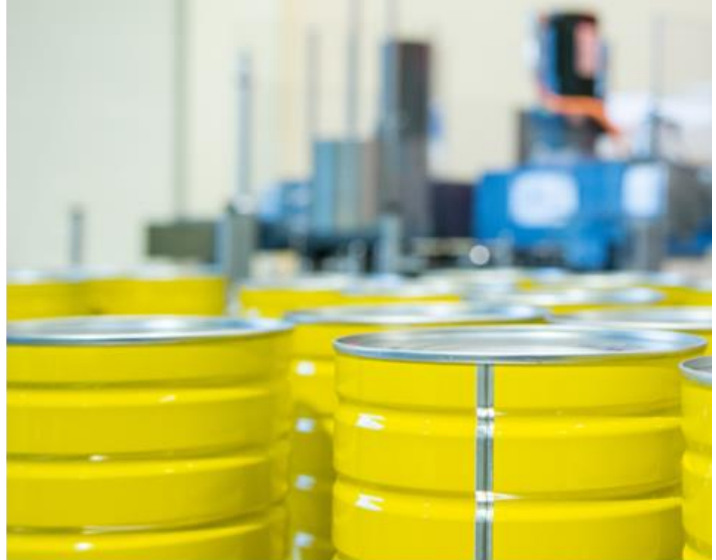
Swiss Can Machinery specializes in filling powder into cans.

Production batches that change frequently with different filling quantities and varying types and sizes of containers: this is precisely where Swiss Can Machinery demonstrates its high performance levels time and time again. The systems have a compact design with their production output of between 20 and 80 cans per minute, and they can also be modified very easily while saving time. This makes them an attractive option for companies that manufacture highly priced special products that change frequently in comparatively small quantities.