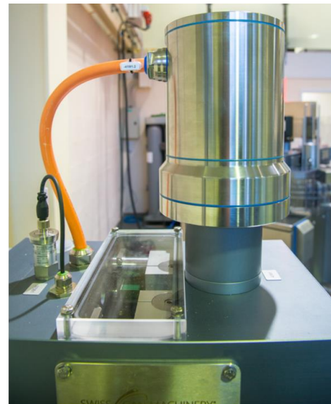
When the systems are used for pharmaceutical or food manufacturers, Swiss Can Machinery prefers to use the AKMH stainless steel servo motors from KOLLMORGEN

“When we look at the whole picture in terms of automation, then we are dealing with machines that are the same in relation to the control engineering, but which just need to have their motors adapted”, says Silvester Tribus. The CEO of TBM Automation AG based in Widnau provided intensive support to Swiss Can with the engineering as a channel partner of KOLLMORGEN. In practice for instance access to the stainless steel motor from the KOLLMORGEN AKMH range is reduced at most in order to fit a flange. “We could not find any comparable manufacturer with such a consistent range available that is right for us”, highlights CTO Marc Grabher.