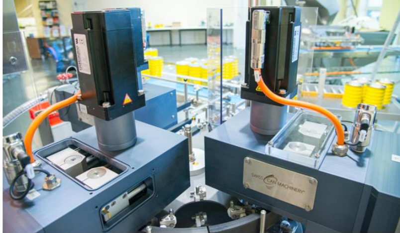
The Swiss company uses standard servo motors from the AKM ranges in areas where hygiene is not relevant.